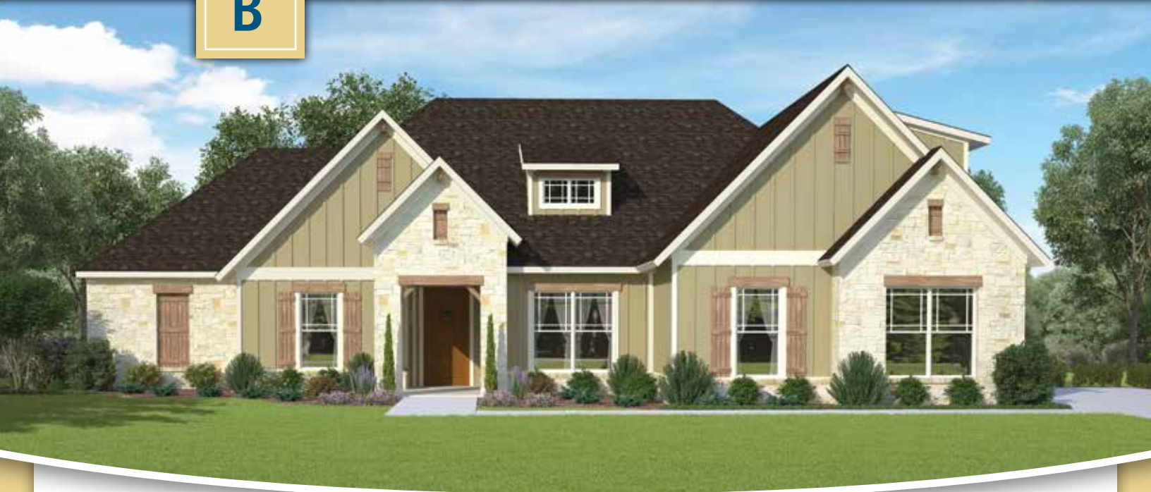
Second Floor 378 Sq. Ft.

2,688 Sq. Ft. 3 Bedrooms | 2 Full 1 Half Bathrooms